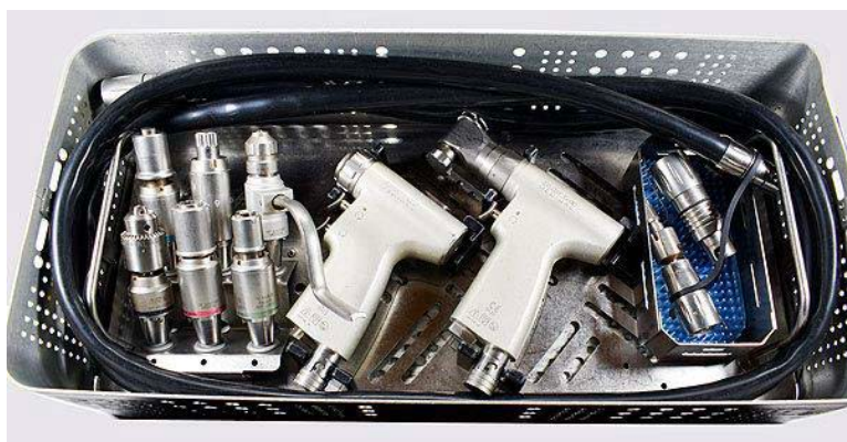
Desoutter Pneumatic Power Tools