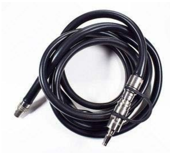
With Air Hose