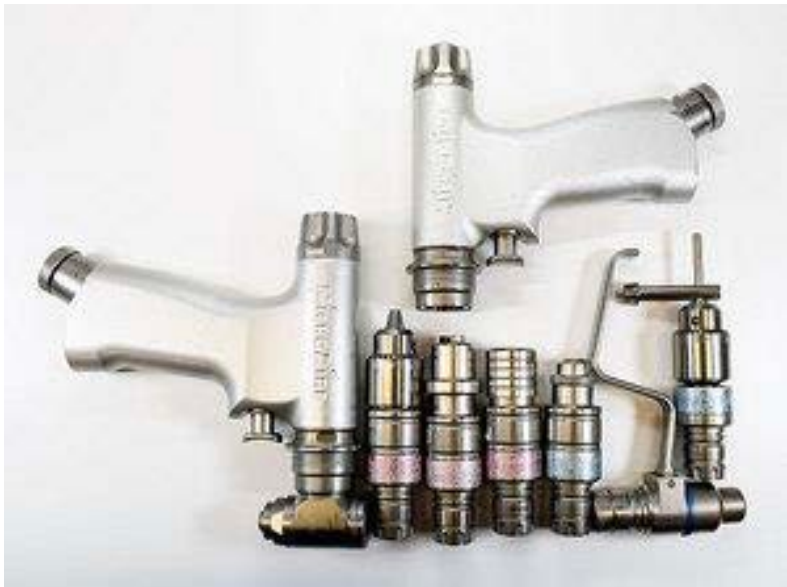
Large Bone 7000 series