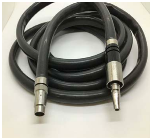
MicroAire Air Hose