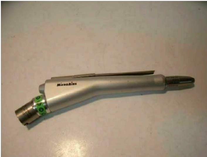
MicroAire Pencil Grip Wiredriver (1625)