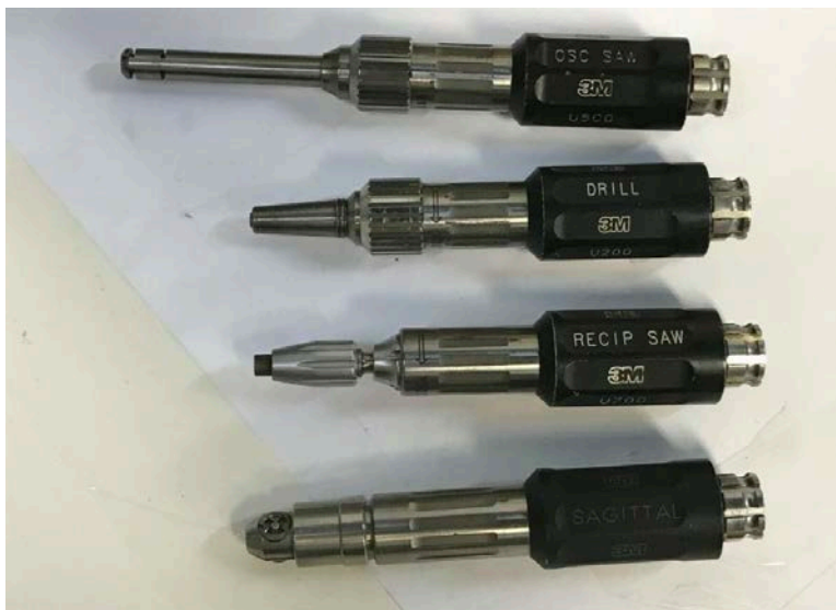
3M Micro-Driver Attachments