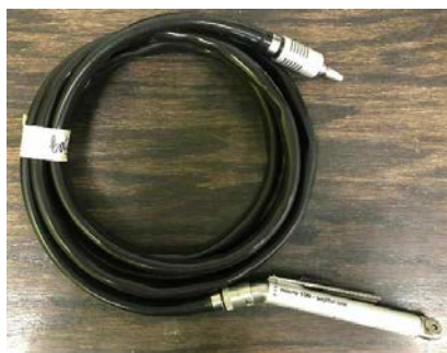
Halls Micro 100 Range