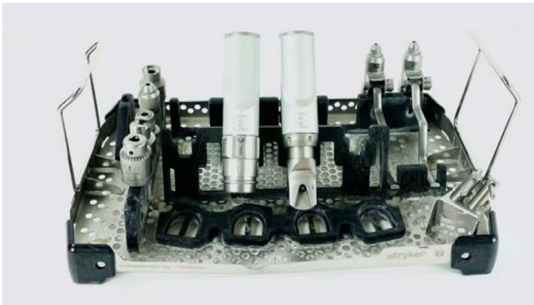
Handpieces with attachments