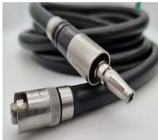
Zimmer type Air Hose