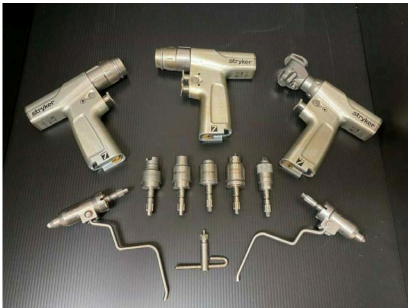
Handpieces with attachments