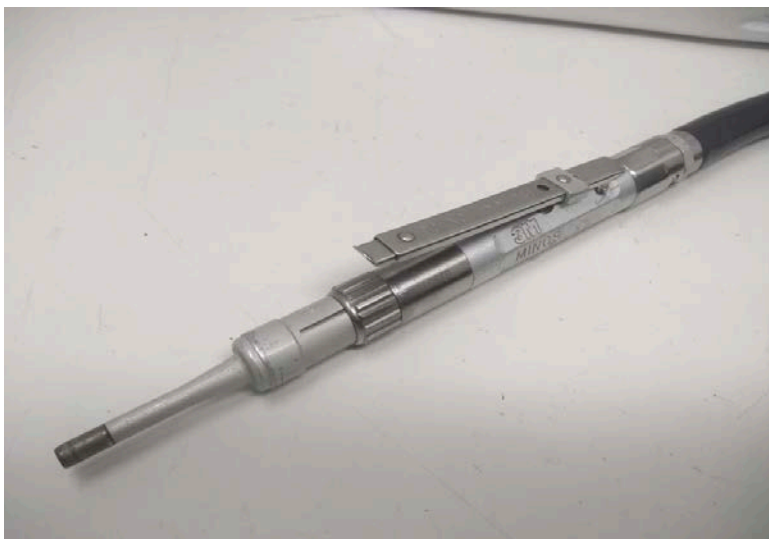
3M Minos (A200) with Burr Guard