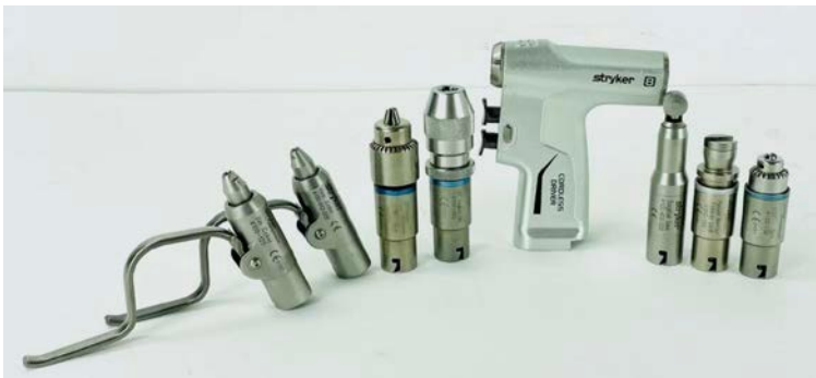
Stryker System 8 Cordless Driver (Battery) & Attachments