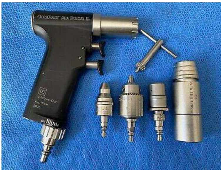
Synthes Compact Air Drive with some Attachments